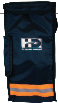
B-30 Carrying Bag

PT-DVI Proof Tester To test the DVI using an external voltage source, the PT-DVI Proof Tester should be used before and after each use to verify proper operation.