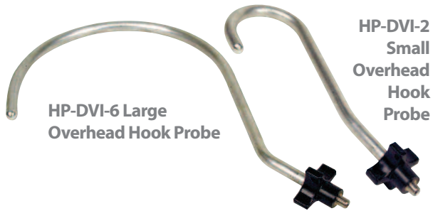
HP-DVI-6 Large Overhead Hook Probe