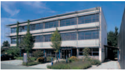
Development centre in Germany