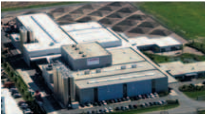
Productions centre for STARstrap™ strapping in Germany