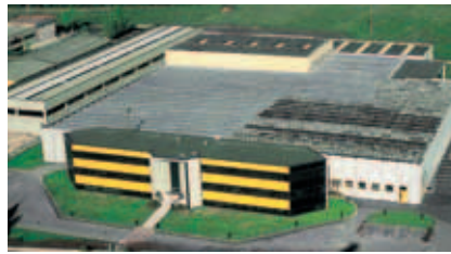
Production centre for machines and equipment in Italy