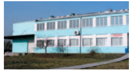
Production centre for machines and equipment in Slovakia