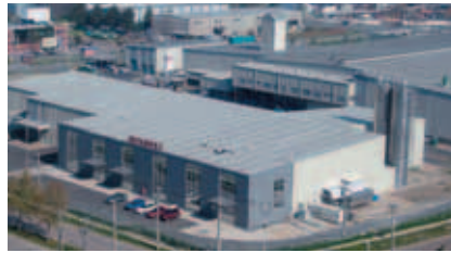
Productions centre for STARstrap™ strapping in Chile